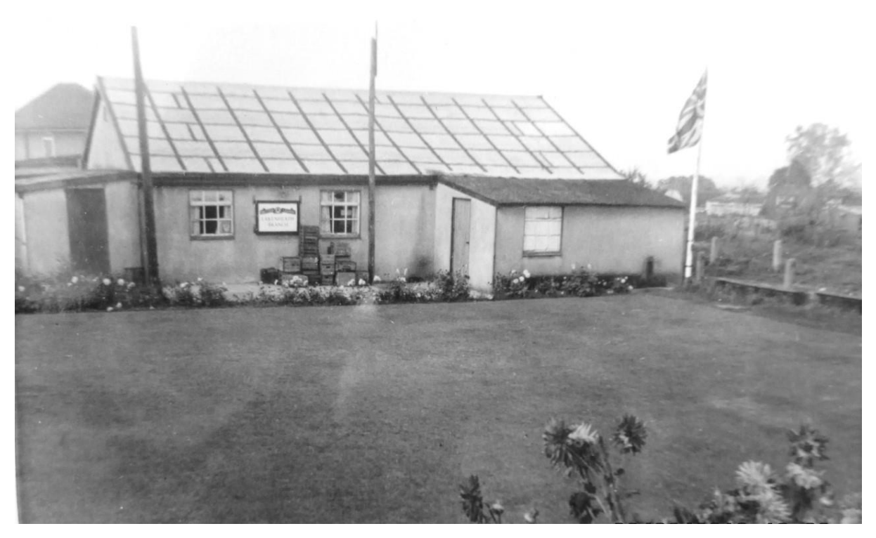
An early photo of 'The Legion'.

By 1956 the British Legion had established a branch in the village, and it was later determined that the whole enterprise should be deeded to the Royal British Legion. The Royal British Legion closed the Lakenheath Branch in about 2013, and the building was left empty until it was put up for sale. In 2015 the then trustees of the Village Hall purchased the building. Over the years it has seen many changes as it attempts to meet community needs.