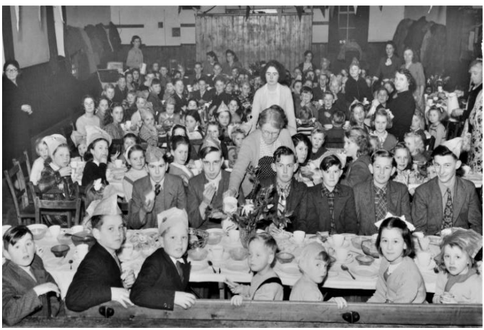
The interior of the Peace Hall circa 1950's. A Christmas Party?